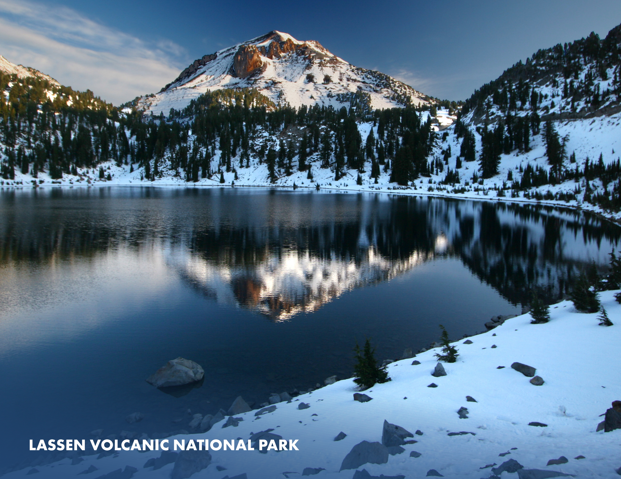
LASSEN VOLCANIC NATIONAL PARK