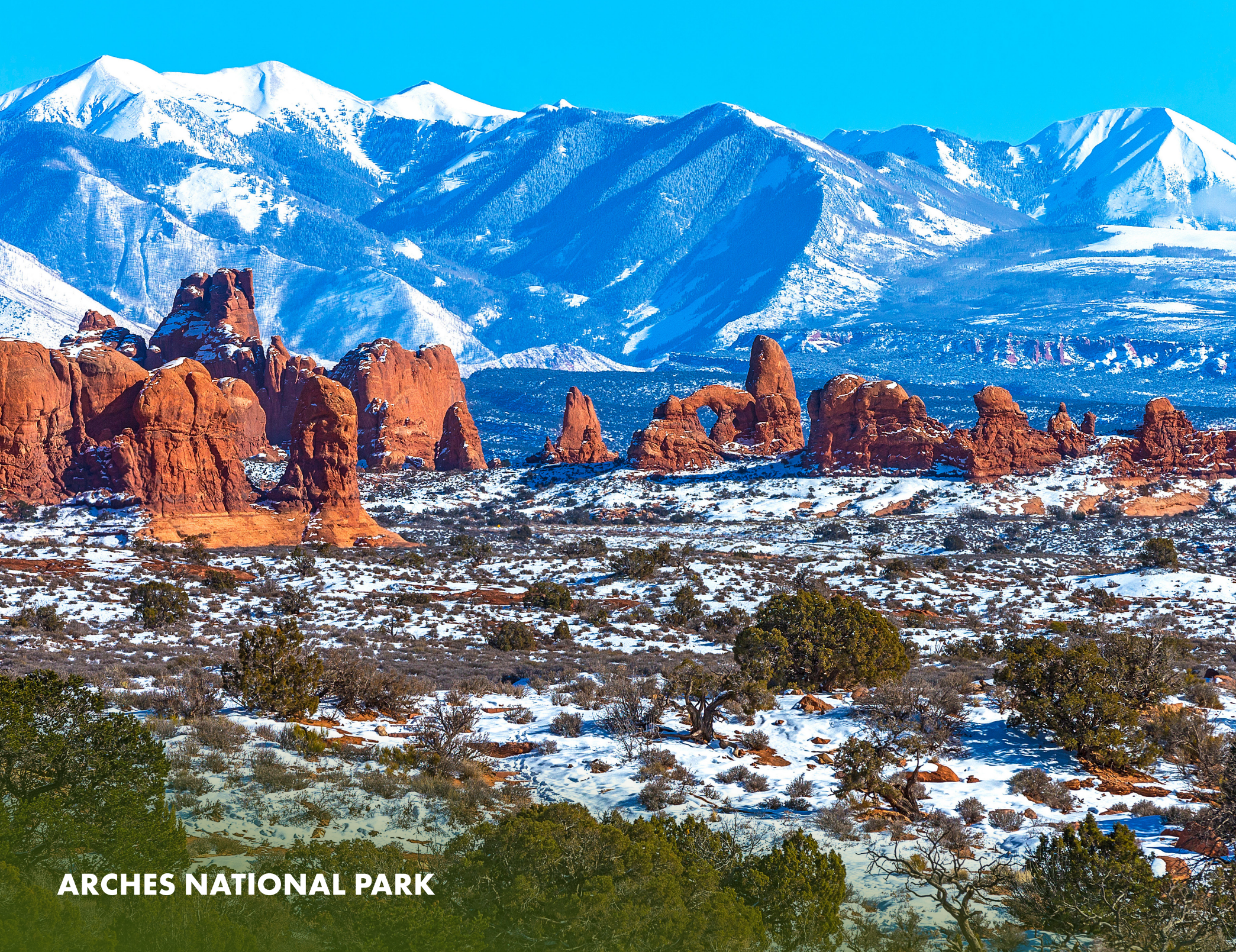
ARCHES NATIONAL PARK